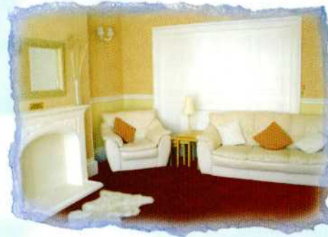
Visitors lounge - great for relaxing, reading or meeting new friends.