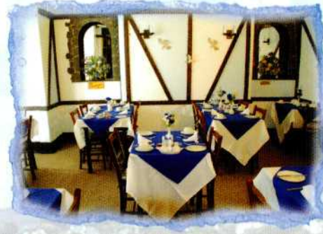
Our spacious dining room is where you can enjoy quality home cooked food.