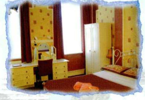
Most rooms are en suite and we have a ground floor room available.