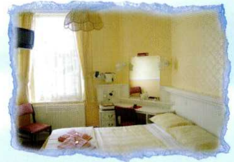
All rooms are tastefully decorated with beverage making facilities & colour television.